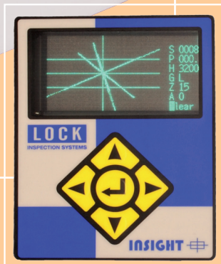
DDS (Direct Digital Signal)