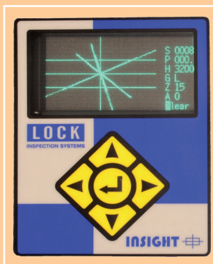
DDS (Direct Digital Signal)