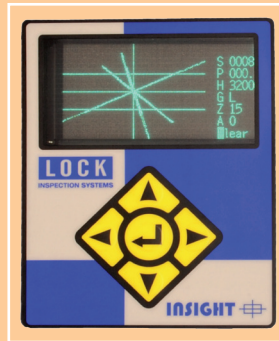
DDS (Direct Digital Signal)